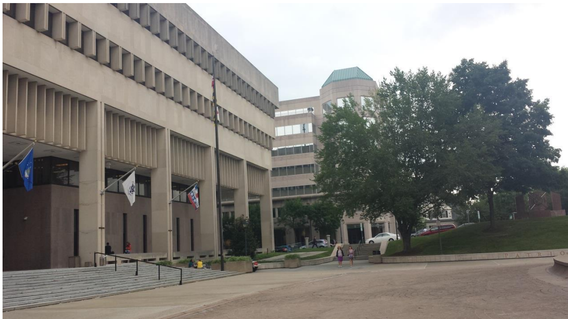
In White and Case LLP: