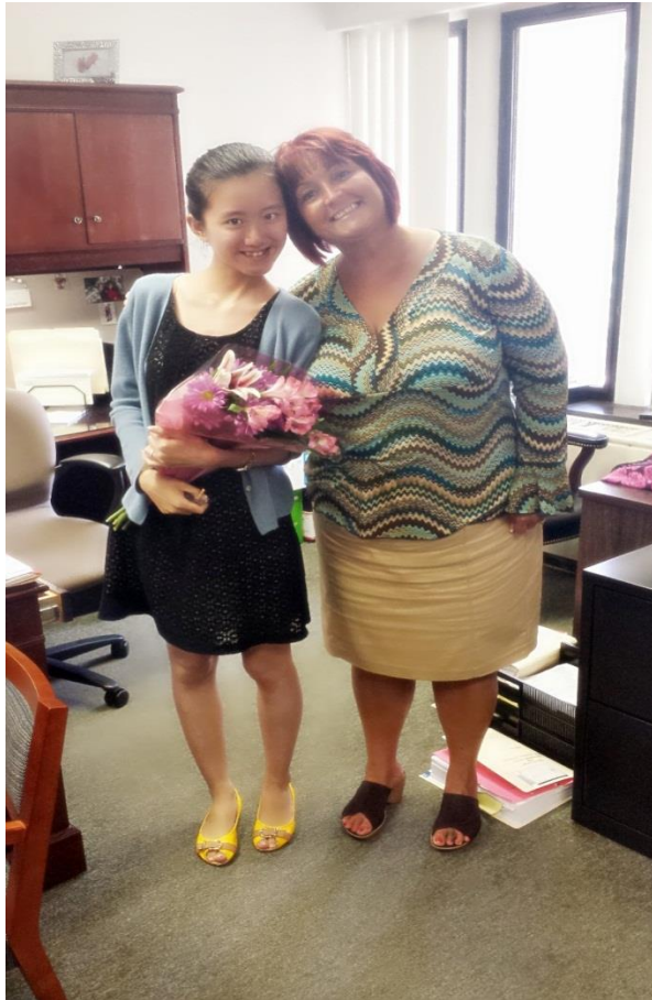
Baltimore County Court: