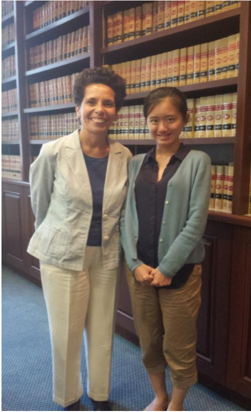
In Supreme Court: