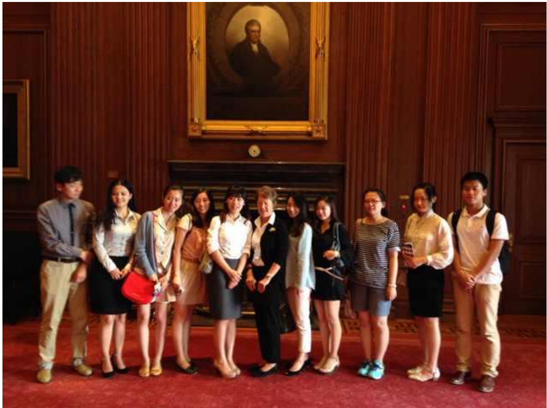
In Princeton University: